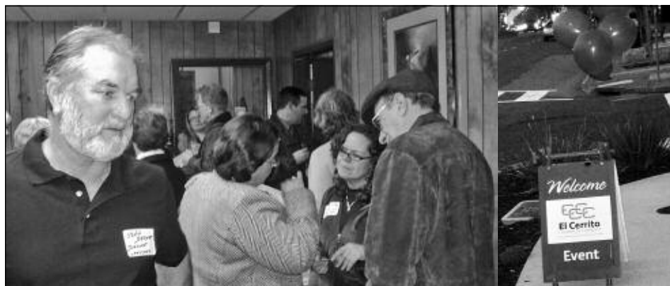
Many attended the grand opening and gave enthusiastic response to our new home. (Now a full house is more than two people in the office!)