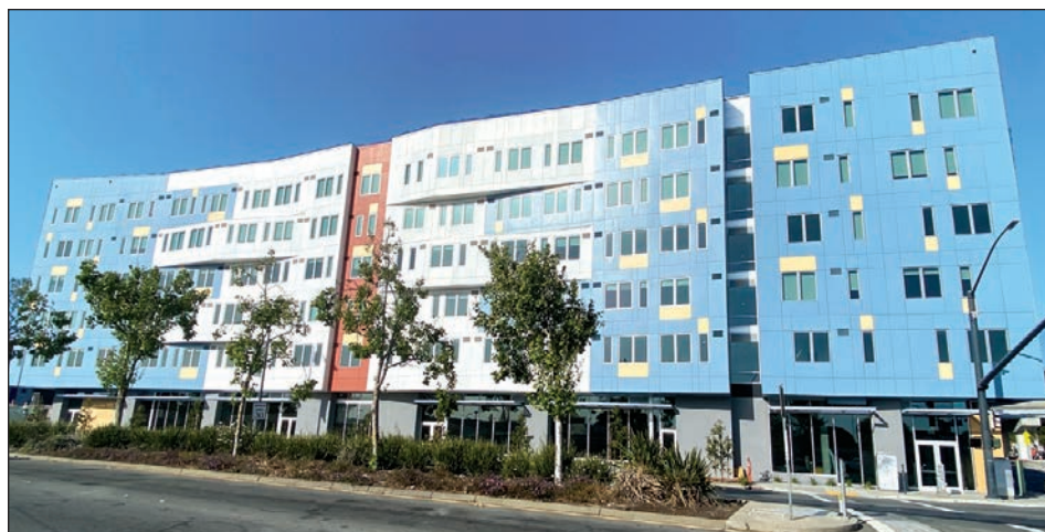
Mayfair Station is located at Cutting & San Pablo, one of the busiest traffic intersections in El Cerrito. Thousands of BART passengers pass by daily to and from the adjacent Del Norte station.