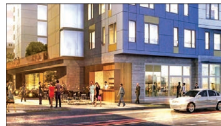
Architect's rendering of the completed building highlighting the northwest corner of Mayfair Station as viewed from San Pablo Avenue.