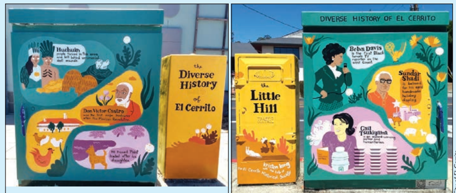
COMPLETION (STREET AND SIDEWALK SIDES)