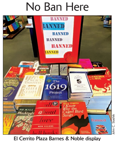
El Cerrito Plaza Barnes & Noble display

Homeroom restaurant. Memo to the Economic Development Committee: