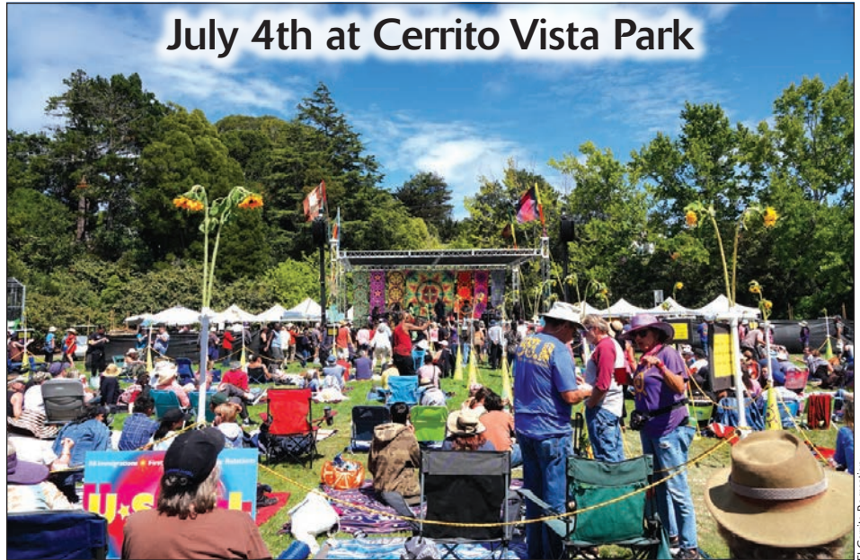
El Cerrito Recreation