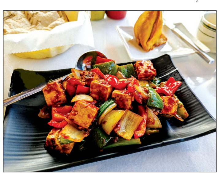
Chili Tofu and Vegetable Samosa

If you love Indian and Tibetan food that's packed with spices and flavors, and if you also enjoy a cultural dining experience, check out Guru Curry House, right here in El Cerrito, today!