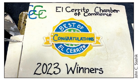
PennDel's Bakehouse created this special cake

The October 26th gathering honored more than 160 local businesses newly