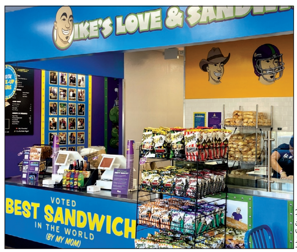
lke's Love & Sandwiches made its El Cerrito debut at last month to a long line of eager lke-sters. Sandwich inventor lke Shehadeh was at the store for two days greeting adoring fans with complimentary meals. Meat, veggie, you name it. Located at 350 El Cerrito Plaza, open from 10 until 9, daily. Look at the menu for two sandwiches available exclusively in El Cerrito.